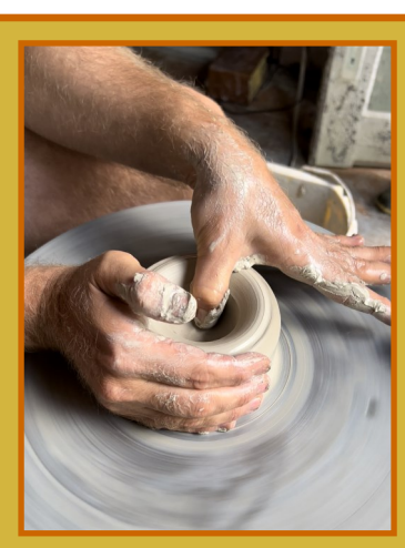
The Seeker's Last Three-Month Apprenticeship in the Local Community

During the last three months of a Seeker's year-long stay at Inner Fire, the Seeker has the opportunity to branch out into the local community by engaging in an apprenticeship with local crafts or trades people, or community service with non-profits. For example, past Seekers have worked with a local potter, blacksmith, stained glass artisan, and glass blower. Community service has included working with restorative justice initiatives, kindergartens, and at soup kitchens. Seekers learn by doing with these local craftsmen and women, who work with their hands and happily engage in will-based work for a living.