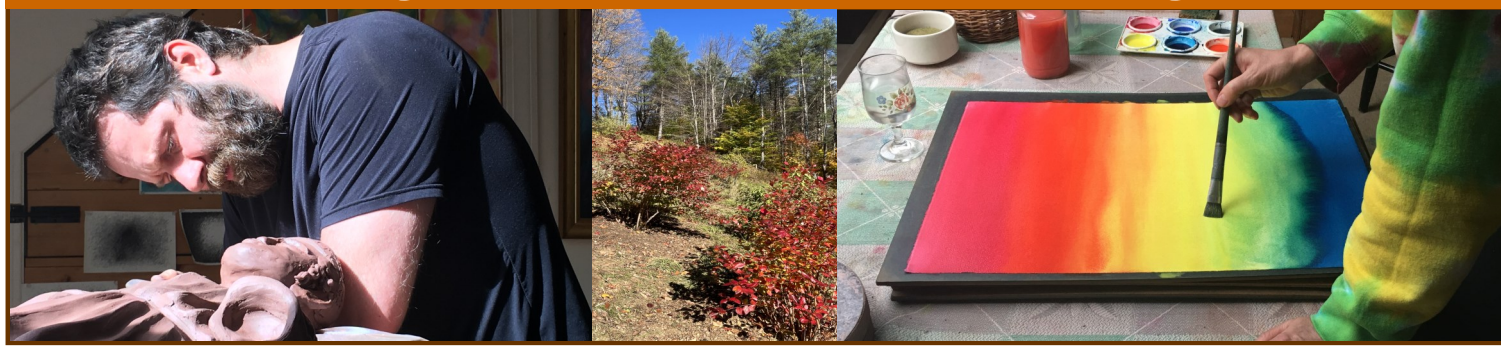
Truth Will Set You Free continued...

Every weekday morning, we went around the circle and expressed our feelings, what we were grateful for, and whether our needs were met or unmet. It was very uncomfortable doing this in the beginning. I didn't realize I oversimplified my feelings to be either good or bad. This led me to feel numb to the intricacy of my own feelings. I had to fight my urge to regress back to a stone-cold, male archetype that was out of touch with my own feelings. Seeing other male figures participate made me feel "oh they're doing it, it's okay for me to do it too". Much of our behavior is influenced by the peers around us. Almost through osmosis through my peers, I learned how this was done over time.